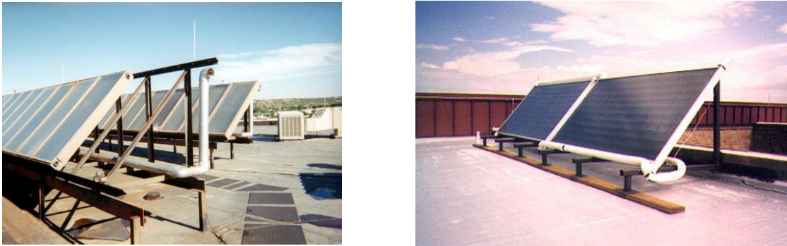
15 16 Figure 3. Medium and Small-Scale Solar Water Heating—Roof Mount

8 The photographs in Figure 3 show typical water heating system solar collectors.