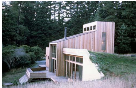
21 22 Figure 2. Passive Solar Architecture 26

15 Figure 2 provides an example of a passive solar residential structure.