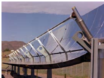
Figure 5. Parabolic Trough Collector

Process heating, used in industrial environments, generally requires the development of much higher temperatures for the production of steam or high heat. Figure 5 shows a parabolic trough system, where a highly reflective parabolic surface concentrates sunlight upon a central liquid-carrying tube. Systems like this are capable of producing process heat and steam in the temperature range of 200° - 400°F.